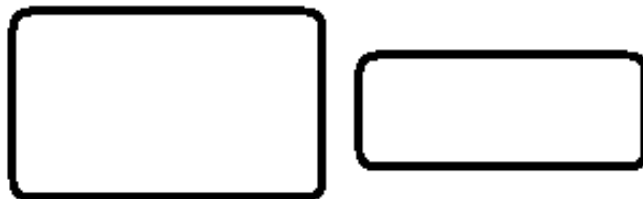
Head to Head

C. If everything fails, change the battery in both your existing and new remote, and then repeat from step 1.