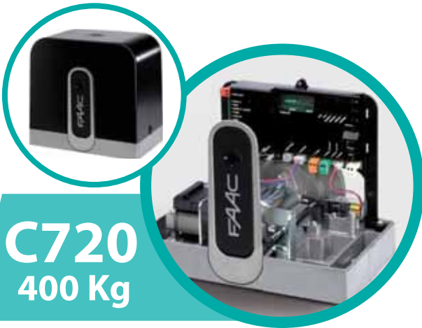
C720 400 Kg