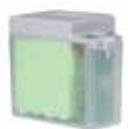
Self regulating 24V back up battery.