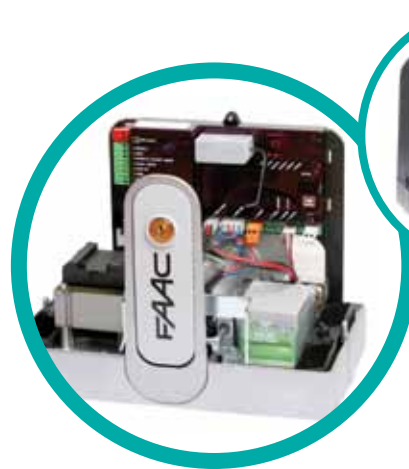
C721 800 Kg